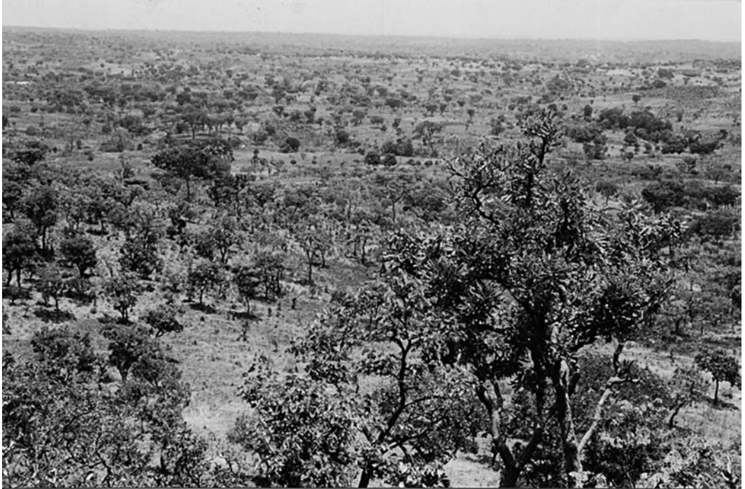
FIG. 2. Open savanna habitat of Leptosiphos koutoui around Meiganga, Central-Northern Province, Cameroon.

in humid leaf-litter in a drainage line. The second specimen was found in disturbed savanna outside the town near the Quartier Ngoakélé. This site was drier, and the skink was found under laterite boulders that had been placed beside a track. There was abundant dry leaf litter around the boulders. The vegetation in the Meiganga area is a small tree soudano-guinean savana with Daniella olivieri and Lophira lanceolata , characteristic of the medium elevated tableland of the Adamaoua (800–1200 m); it concerns there more precisely a Terminalia mollis facies on stony hills, highly degraded by quasi-permanent pasturage.