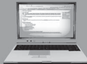
Table of contents Podcasts Ahead of Print Medscape CME Specialized topics